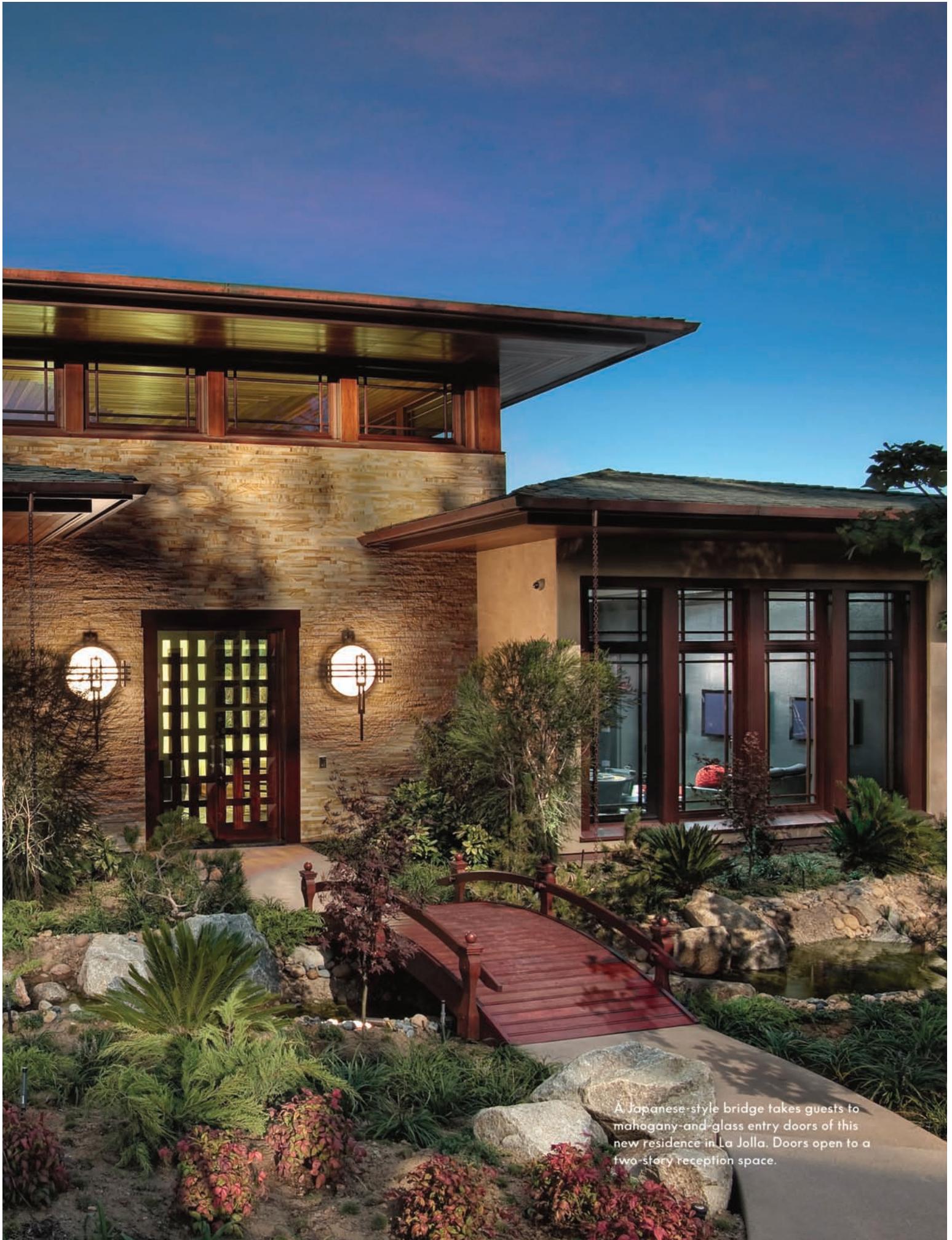
A Japanese-style bridge takes guests to mahogany-and-glass entry doors of this new residence in La Jolla. Doors open to a two-story reception space.