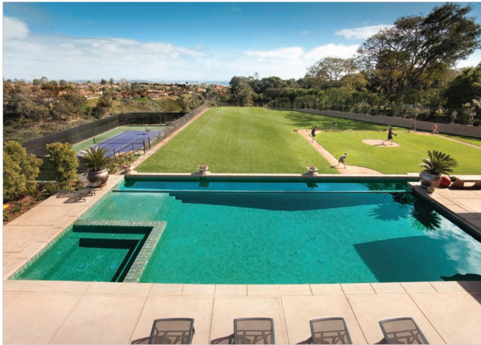
A Little League-sized baseball field overlooks a tennis court.

pleted a project that all say was a textbook example of collaboration. All had lived with their “baby” for years.