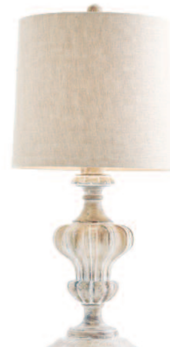
Available through Arteriors Home, this classically elegant lamp is made of mango wood with a whitewash finish. Blake Antique Whitewash Turned Wood Lamp, $399; arteriorshome.com