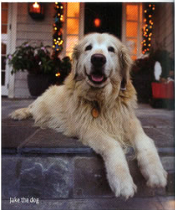
Jake the dog