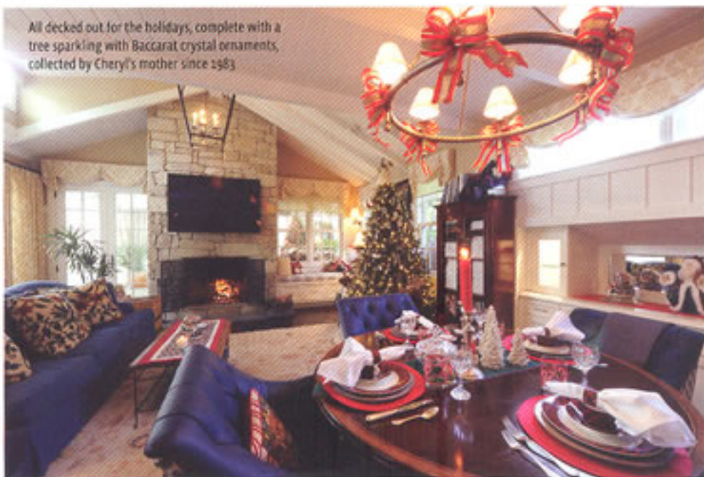
All decked out for the holidays, complete with a tree sparkling with Baccarat crystal ornaments, collected by Cheryl's mother since 1983