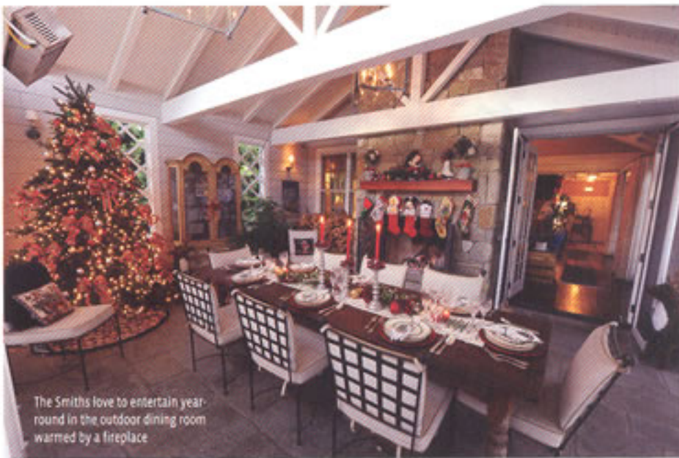
The Smiths love to entertain year-round in the outdoor dining room warmed by a fireplace